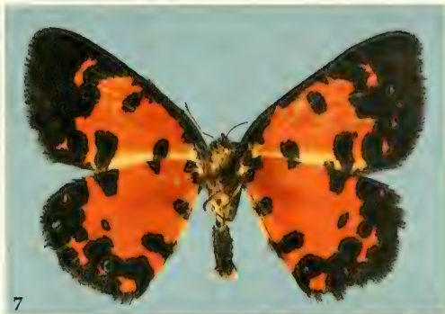
Figs 6-7. Inouea hiroshii , spec. nov., Holotype, ♂, upper side (6) and under side (7), Mindanao.